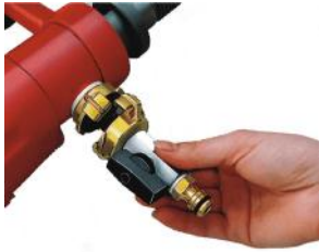
DK09: Coupling ball valve for wet drilling