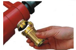
DK09: Coupling exhaust adapter for dry drilling